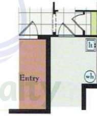
Opt. Laundry Tub at Garage